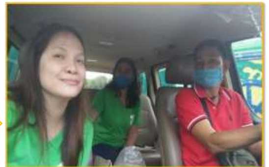
The group! ☺